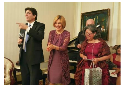
The famous fish at the Bulgarian Christmas Dinner for WIPAC, Blagodorja!!!!