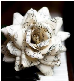
Notes as a Rose Radio Classique